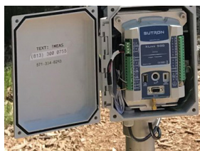
NEMA-4 Enclosure for -1E and -1C part numbers

NOTE - Cellular Modems Include: C1: Verizon LTE (4G) - US ONLY C3: LTE (4G) - EU ONLY (coming soon) C5: HSPA (3G/2G) - Global C6: LTE (4G) Cat M1/NB-IOT - Global (coming soon)