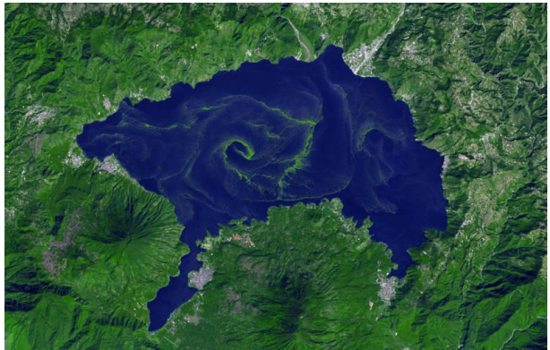
Satellite image of a cyanobacteria bloom

Phytoplankton are microscopic, free-floating photosynthetic plants and bacteria that are commonly found in surface waters throughout the world. Aquatic scientists and water resource managers measure phytoplankton to gain insights on ecological dynamics, ecological health, nutrient status, and harmful algal bloom potential in aquatic systems. Submersible fluorescence sensors help to make this measurement easy, efficient, and economical by enabling real-time field estimates of phytoplankton biomass that can be directly correlated to standard laboratory quantitative measurements.