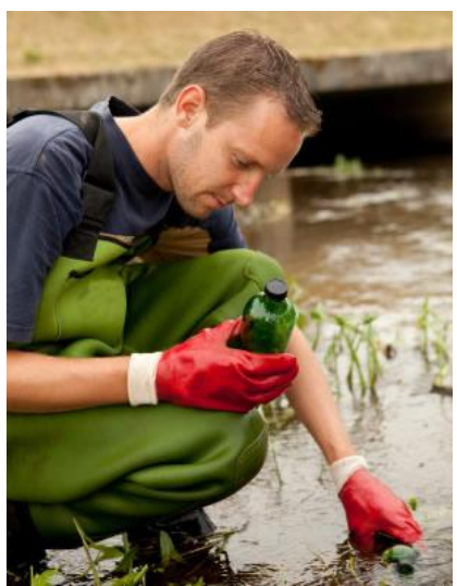
A representative grab sample is used as a primary standard for in vivo phytoplankton measurement

In vivo phytoplankton sensors require a two point calibration, including a blank (de-ionized water or filtered sample water), and a non-zero standard. Unlike sensors for pH, conductivity, and turbidity, there are no bottled primary calibration standards readily available for in vivo phytoplankton as this analyte is part of a living biological organism. A representative grab sample from the environment is actually the true standard for in vivo phytoplankton monitoring; it just requires an additional step of in vitro laboratory quantification if meaningful concentration units are desired.