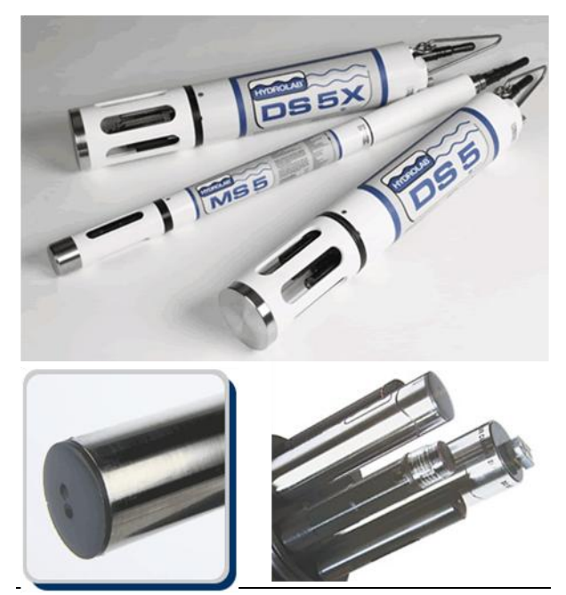
Hydrolab sondes and sensors. Fluorescence sensor shown on bottom left

In vivo chlorophyll a is typically the most commonly deployed sensor among the three in vivo phytoplankton fluorescence sensors offered on Hydrolab sondes, followed by phycocyanin and phycoerythrin. The optics on the in vivo chlorophyll a sensor are specifically aligned with the in vivo fluorescence signature of the chlorophyll a pigment. This optical configuration provides in vivo data that is directly relevant to extracted chlorophyll a measurements, which is important considering that EPA standard methods are specifically based on chlorophyll a pigment concentrations.