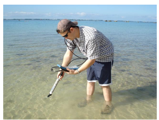
Real-time in vivo phytoplankton measurement using fluorescence sensors on a Hydrolab sonde

Fluorescence can be described as the phenomena of certain molecules or compounds that absorb specific wavelengths of light and instantaneously emit energy wavelengths of light. Relevant to the topic of phytoplankton measurement, chlorophyll, phycocyanin, and phycoerythrin are all fluorescent pigments that can be measured using fluorescence instrumentation. Fluorescence measurements of these pigments can be made in vitro ("within the glass") in the laboratory and in the field with submersible in vivo ("within the living") fluorescence sensors.