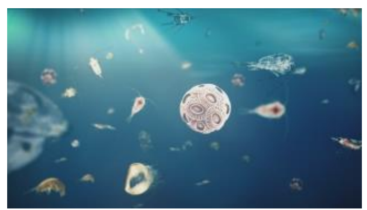
Phytoplankton come in many different shapes, sizes, and colors

Pigments provide a vital function by absorbing light energy needed for photosynthesis. In this process, light energy from the sun drives a reaction where carbon dioxide and water are converted into sugars. Oxygen is given off as a reaction byproduct. As phytoplankton are able to create their own chemical energy through this process, they are commonly referred to as "primary producers" within aquatic ecosystems. These primary producers form the foundation of aquatic food webs, where they are consumed by organisms higher up on the food chain, such as zooplankton, invertebrates, and fish.