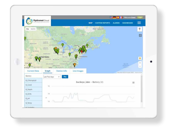
Quickly view current measurements, identify how data is trending, and confirm stations are functioning properly- collecting good data

Combine parameters (e.g. add coefficients), stage/ flow rating calculation, periodic averages, incremental precip, sum, min /max, etc.