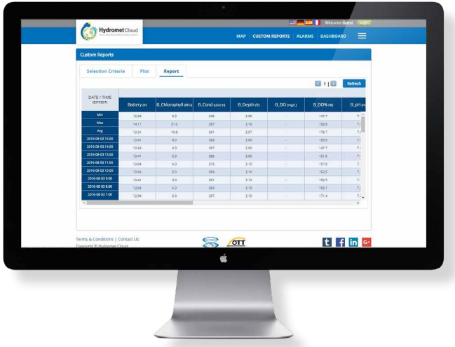
Hydromet Cloud can help you assess when a site visit is required and retrieve data as needed to create data product, e.g., reports