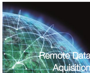
Remote Data Acquisition