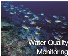
Water Quality Monitoring