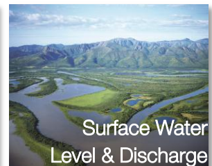
Surface Water Level & Discharge