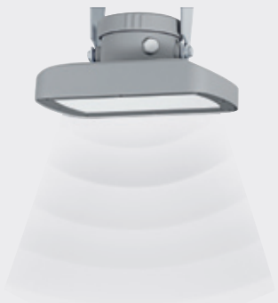
Low power radar for field applications