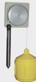
Beaded cable for tide measurements