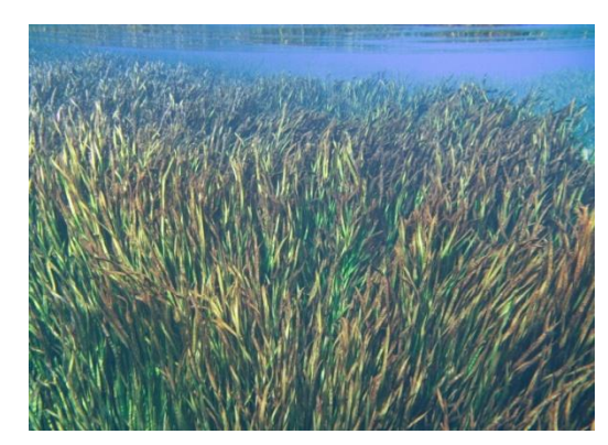
Highly productive plant biomass in the Silver River.