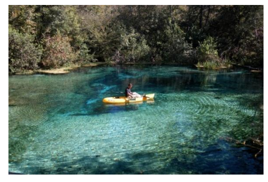
High water clarity at Ichetucknee Head Spring.