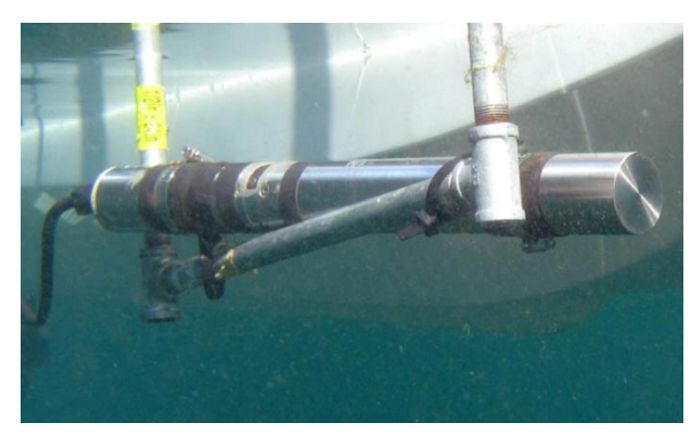
SUNA deployed for longitudinal profiling.