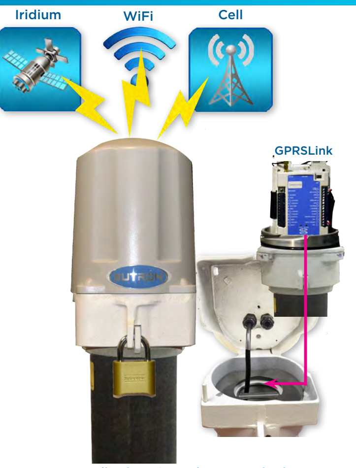
Application: Groundwater Monitoring

Weight:: 6.7 lb including battery & logger (3.04kg)