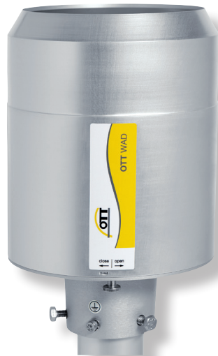
Precipitation measurement OTT WAD 200 Weighing rain gauge with automatic drain