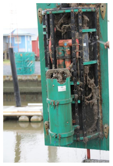
Delaware LOBO.

In addition these sensors are integrated into the Stor-X submersible datalogger and connected to an external modem which transmits the hourly data to the web. The web interface allows the operators and the public to view and graph the preliminary data within minutes of the sample being analyzed. Power is supplied by solar panels.